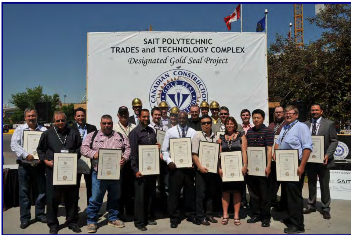
Gold Seal Certificates were presented to twenty individuals in attendance on July 6, 2011.

Congratulations to the following individuals on receiving your Gold Seal Certificate: